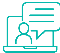
Semi-structured interviews Three current partners

In early 2023, ASHM conducted stakeholder consultation via a listening exercise through semi-structured interviews and open-ended survey questions with 10 current and former partner organisations across nine countries in Asia and the Pacific. A list of organisations who participated can be found in Appendix A, alongside a summary of ASHM's projects with each partner.