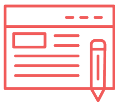
Online open-ended surveys Seven previous partners