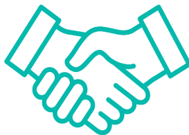
Co-design and collaboration