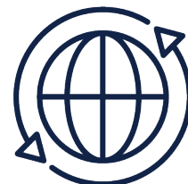
Cross country knowledge exchange and relationship building

Areas for improvement were also identified through the listening exercise. Most notably, several partners mentioned that ASHM could take a larger role in facilitating region-wide networks.