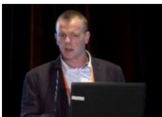
The Australian Care Cascade

Videos presentations + speaker Powerpoints are now available via the art of ART program page