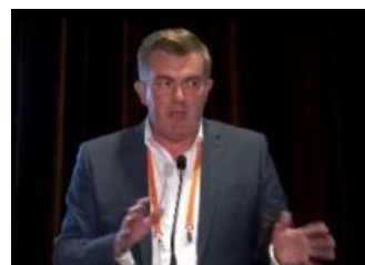
Innovative ways to stimulate the demand for HIV testing