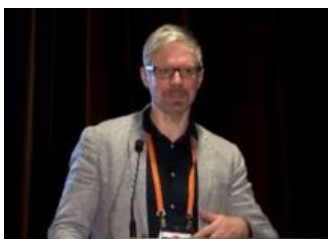
Communicating Control: The Development of Early